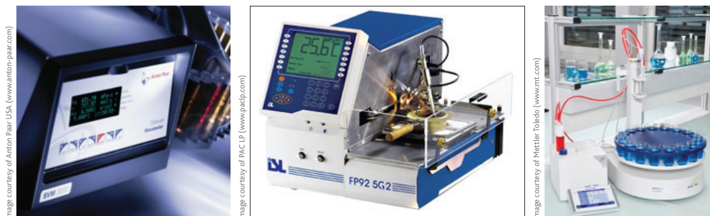
Figure 1 —Typical instruments for measurement of density and viscosity, flash point, and total acid number (left to right).